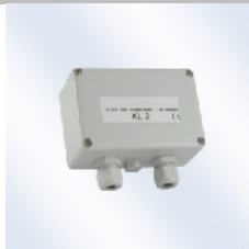
Cable Terminal Box with Vent