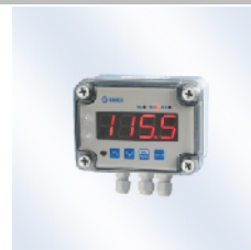
Wall mounted digital indicator

Please visit our website: www.mctram.com