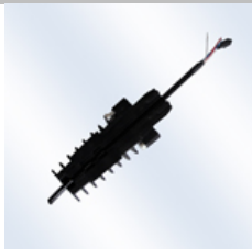
Cable support hanger